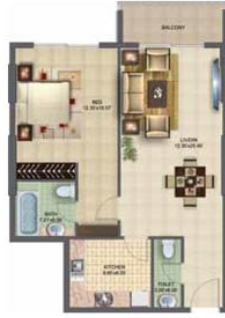
IB/R Type - B Unit Nos. 2, 19