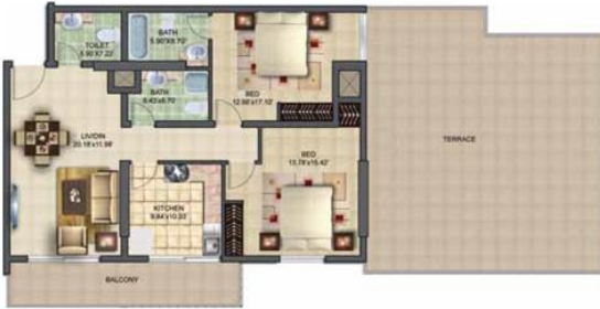
2B/R Type - P Unit Nos. 3, 9