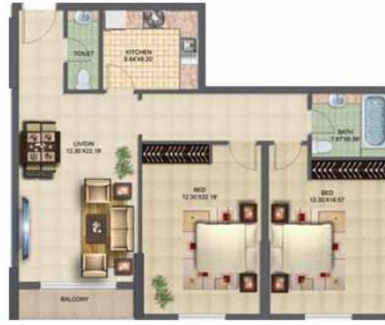
2B/R Type - O Unit Nos. 2, 8