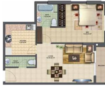
IB/R Type - C Unit Nos. 3