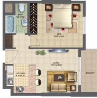
IB/R Type - E Unit Nos. 5, 15