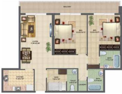
2B/R Type - N Unit Nos. 1, 12