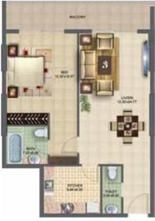
IB/R Type - A Unit Nos. 1, 20