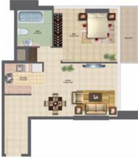
IB/R Type - D Unit Nos. 4, 14