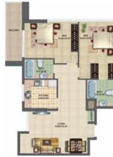
2B/R Type - Q Unit Nos. 4