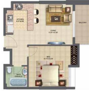
IB/R Type - F Unit Nos. 6, 16