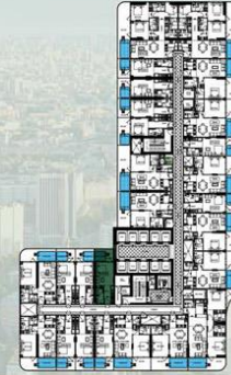
TYPICAL FLOORS 11, 21, 31 STUDIO WITH POOL T - 01