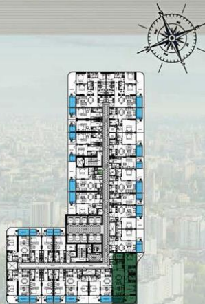
TYPICAL FLOORS 11, 21, 31 2 BEDROOM WITH POOL T - 11