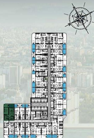
TYPICAL FLOORS 11 - 21 - 31 1 BEDROOM WITH POOL T - 04